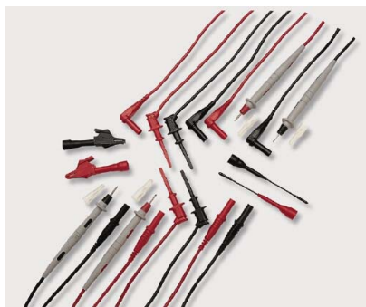
34132A Deluxe Test Lead Kits