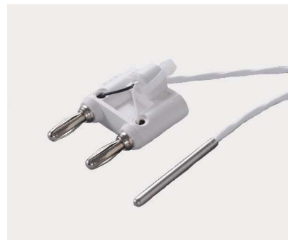
E2308A Thermistor Probe