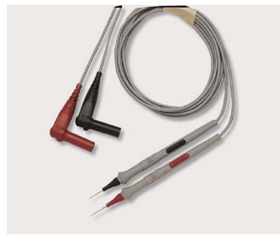
34133A Precision Electronics Test Leads