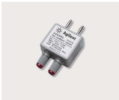
34330A 30A Current Shunt